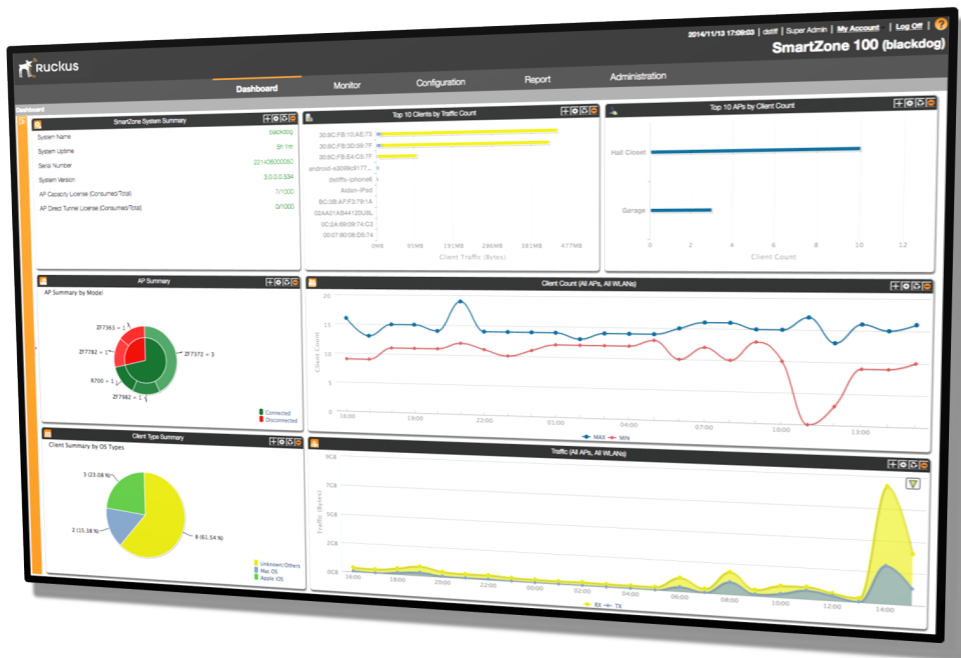
Below: The SmartZone 100 per user customizable dashboard

Ruckus Smart Mesh Networking enables self-organizing and self-healing WLAN deployment. It eliminates the need to run Ethernet cables to every AP, allowing administrators to simply plug in ZoneFlex APs to any power source and walk away. All configuration and management is delivered through the SmartZone™ 100 Smart WLAN controller. APs can also be daisy-chained to mesh APs to extend the mesh and take advantage of spatial reuse.